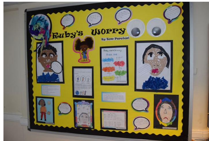
Such a range of wonderful learning!