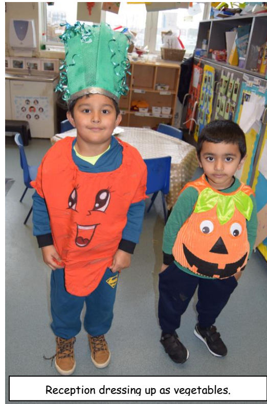
Reception dressing up as vegetables.