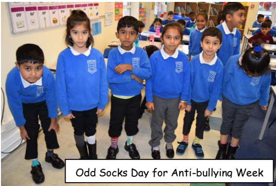
Odd Socks Day for Anti-bullying Week