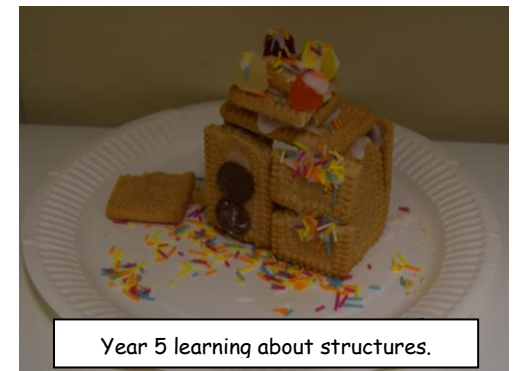
Year 5 learning about structures.